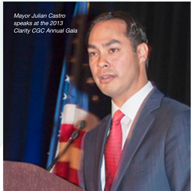
Mayor Julian Castro speaks at the 2013 Clarity CGC Annual Gala

We will be adding a six-bed psychiatric emergency service for kids, 14 additional inpatient beds, a new and expanded outpatient center, and other additions to increase care to children.